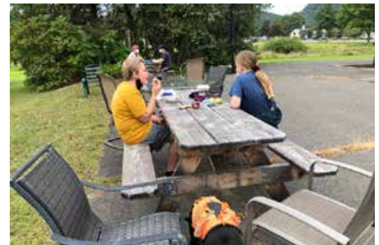
At the picnic table on a warm fall day