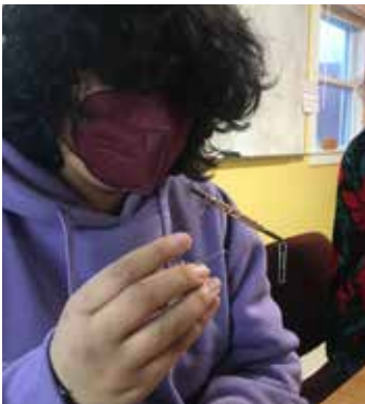
Making electromagnets in Science Class