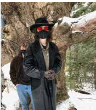
Hiking at Conway Hills