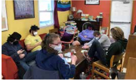
A fierce game of UNO in the Common Room