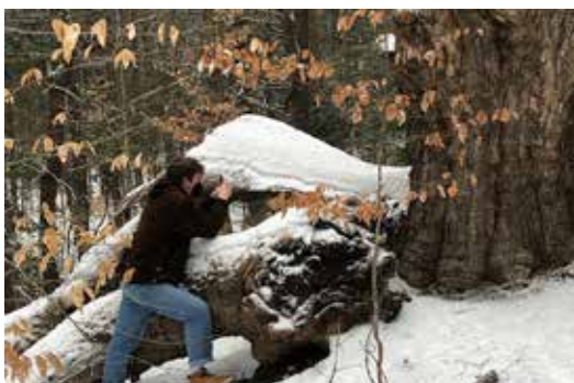
Appreciating a wolf tree