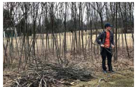
Enjoying a day in early spring