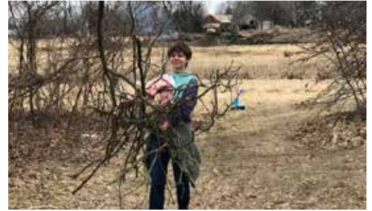
Gathering fallen branches for a backyard fire