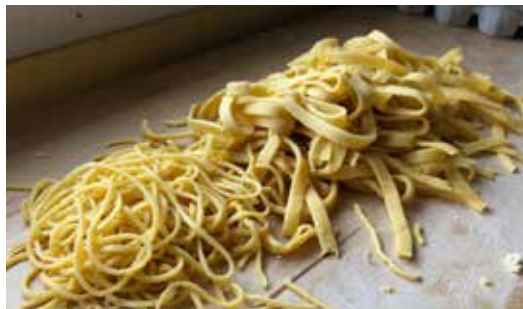
Homemade pasta in Food & Culture class