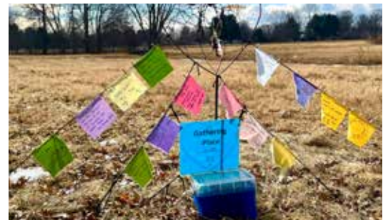
The Gathering Place