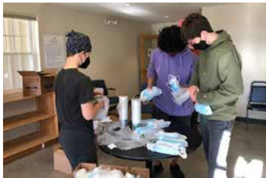
Volunteering at Amherst Survival Center