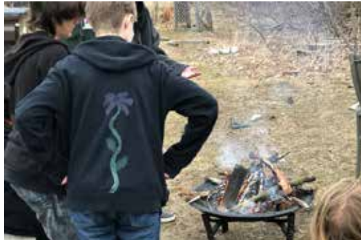
Building a fire