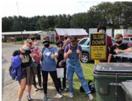
Setting up recycling stations at Franklin County Fair