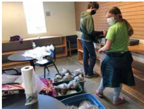
Volunteering at Amherst Survival Center