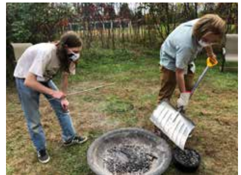
Tending the embers in Fire! class