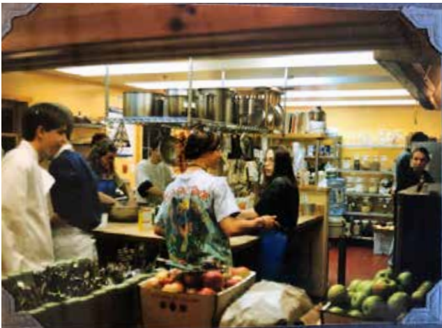
Pathfinder teens baking pies at Pioneer Valley Co-housing kitchen, November 1996. Can you name the people in the photo? Email ken@northstarteens.org .

This year we are happily back to our tradition of baking pies for the Survival Center, but in a new way. Because we need to work in a ServSafe certified kitchen with a ServSafe certified supervisor, a small number of teens (regular ASC volunteers plus 1-2 other experienced teen bakers) will gather at Amherst Survival Center's kitchen. We'll perform a power-bake and make 30 pies in 2½ hours. The experience will be different from the longer, more leisurely days with a big crowd at the co-housing common room, but I'm excited to see what we can accomplish together. And of course we will be proud to share delicious homemade apple and pumpkin pies with members of our extended community!