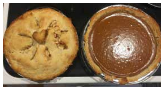
Apple and pumpkin pies baked at home over Zoom, November 2020