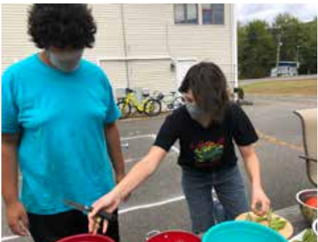
Chopping okra outdoors in Food & Culture class