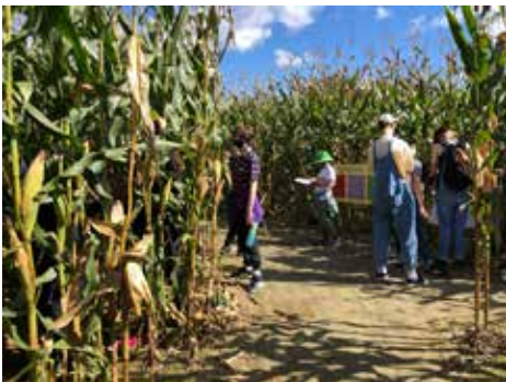
A beautiful fall afternoon at Mike's Corn Maze

Best wishes for the upcoming holiday season.