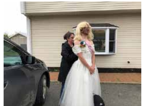
Last-minute Halloween costume tweaks